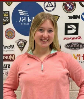
Cadence Hayes Therapeutic Services